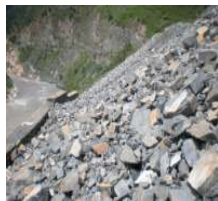
Slope with stones