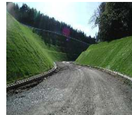
Enhancement of vegetation growth